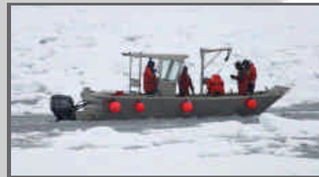
Members of the Long Term Ecological Research team use the new aluminum boat to cross through brash ice near Palmer Station.